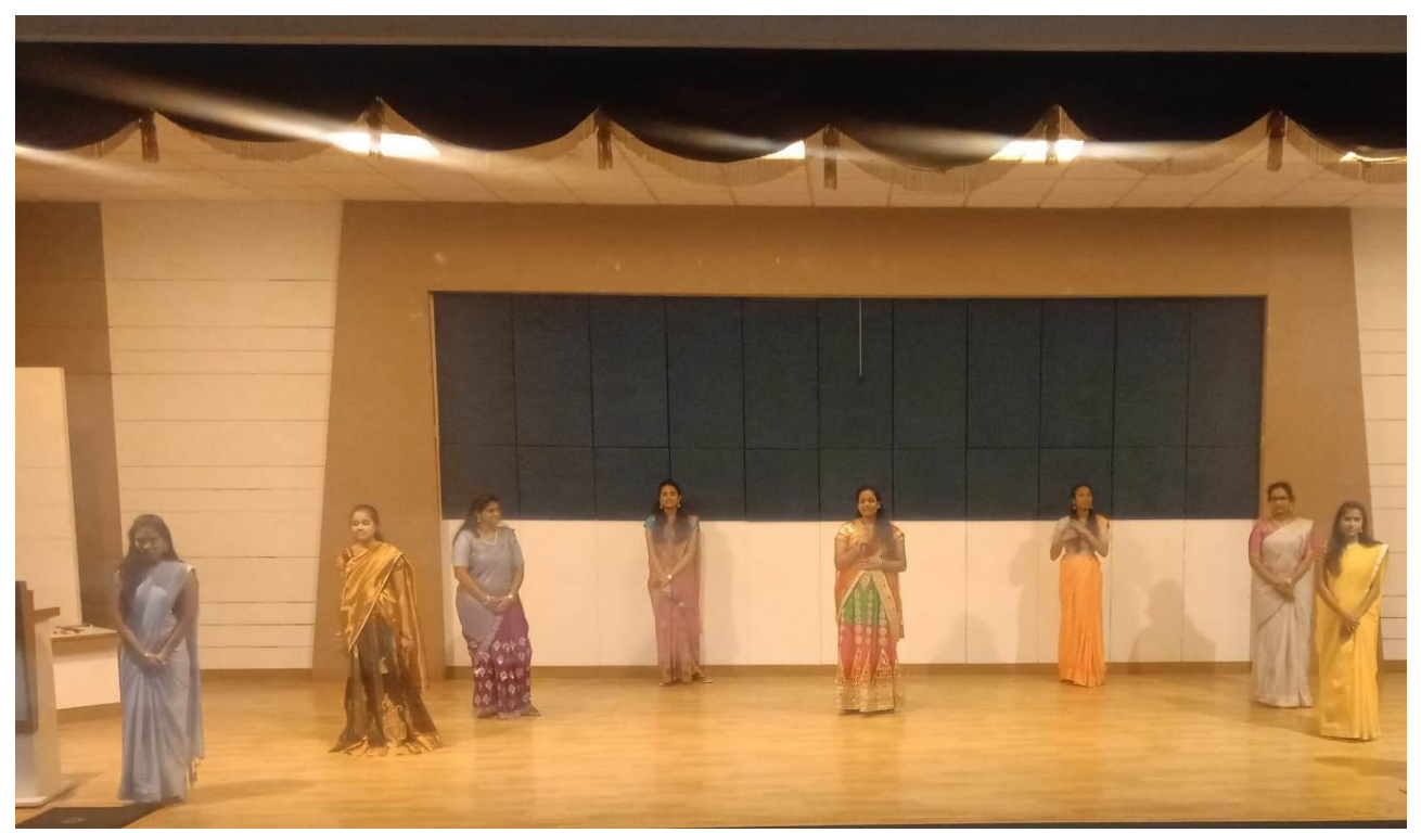
A Part of Girl Participants