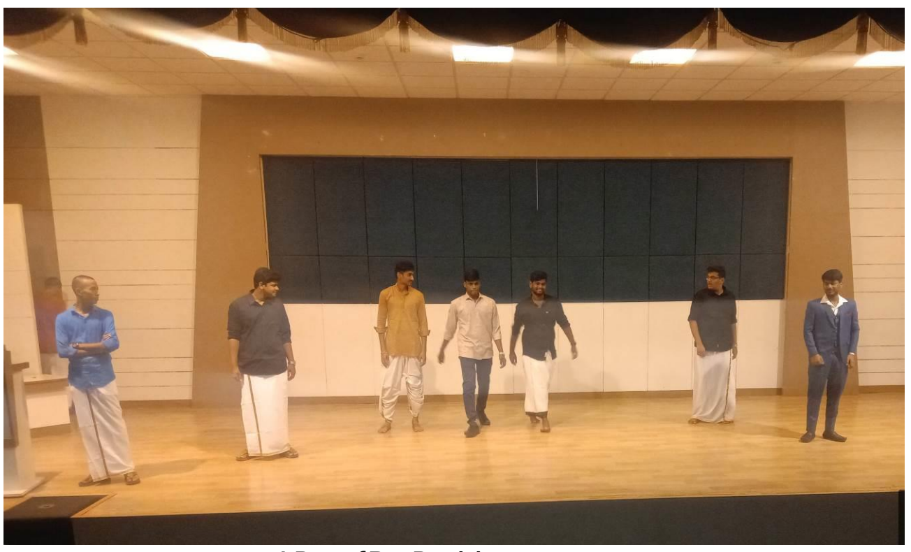
A Part of Boy Participants